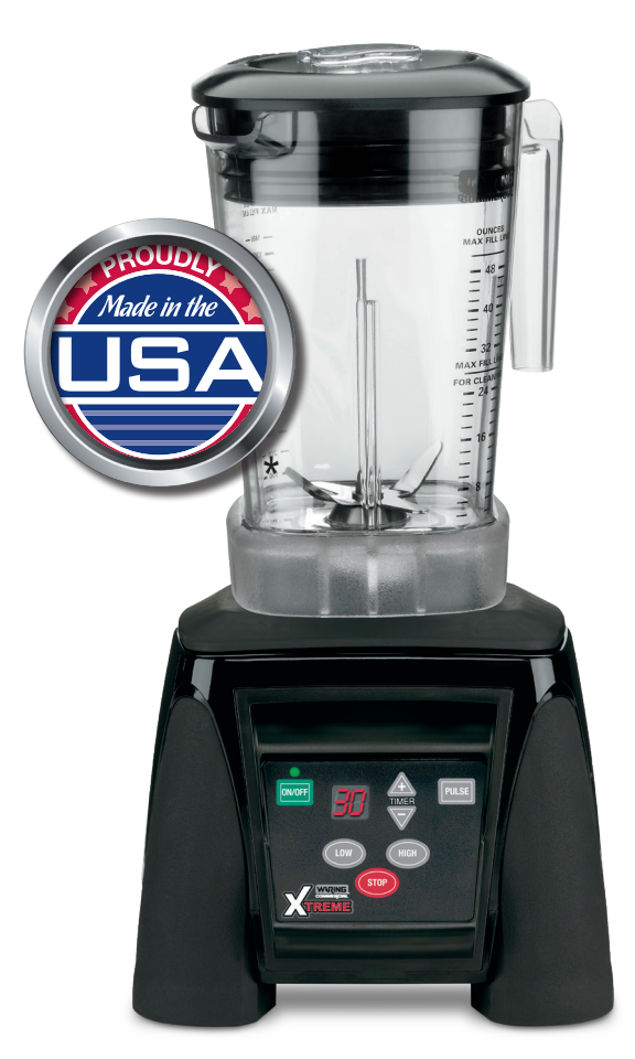
*Made in USA with US and foreign parts.