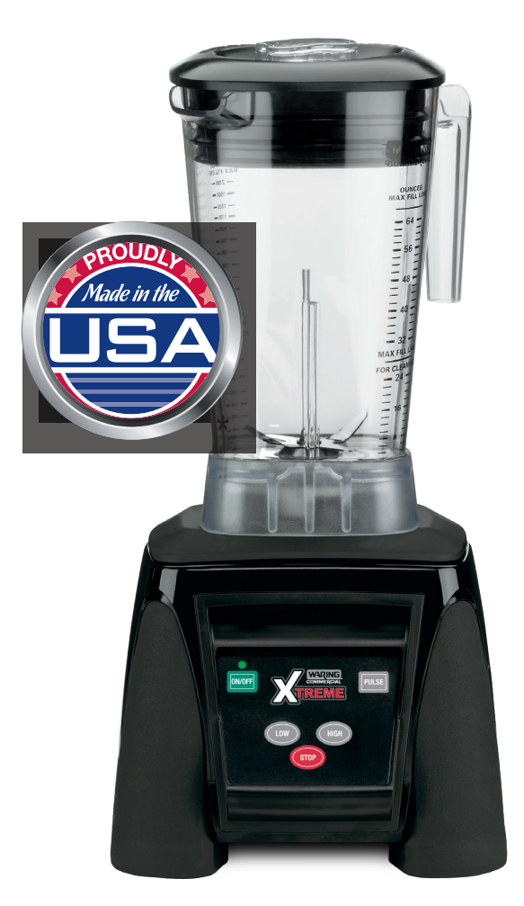
*Made in USA with US and foreign parts.