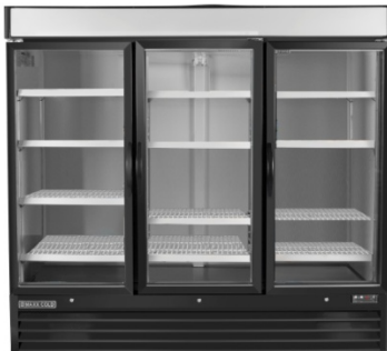
MXM3-72FB (Color: Black)

Glass Door merchandisers are designed for durability and visual appeal in promoting your product. Glass door merchandisers are energy efficient and effective at keeping product at exactly the right temperature. This keeps food fresher for longer. The simple-to-use but precise digital controls allows for accuracy in temperature and flexible use of the unit.