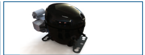
Easy access to compressor