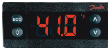
Electronic digital controller