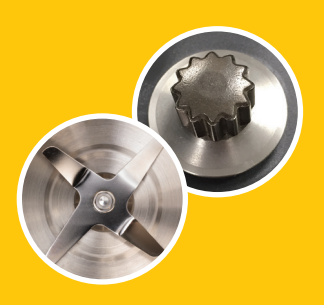
Lifetime Warranty on Motor Drive Coupling and Stainless Steel Blades