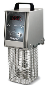
SOFTCOOKER XP 120/230 MADE IN ITALY