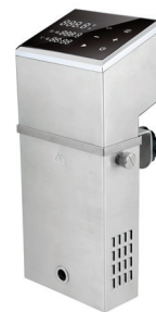
SV-310 MADE IN CHINA