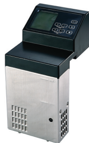
SV-120 MADE IN CHINA