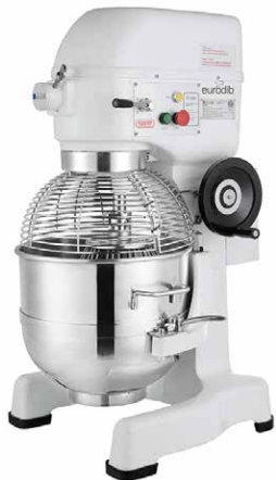
M40A 220ETL - 40 Qt