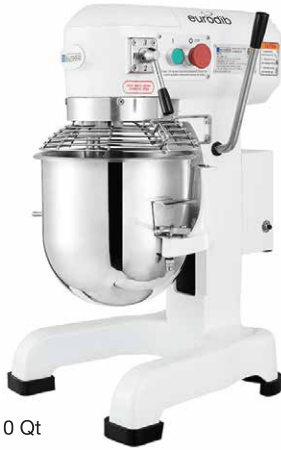
M10 ETL - 10 Qt

★ M10 ETL , M20 ETL and M30 ETL are NOT SUITABLE for pizza, pita or bread dough. Stop the machine to change speed. Do not mix dough at middle or high speed.