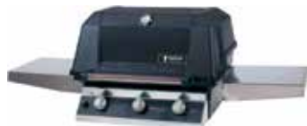
Overall Dimensions (without shelves) 26-3/4" W x 19" H x 24-1/2" D

All grills are available in natural or propane gas LP hose & Regulator available on LP grill models only