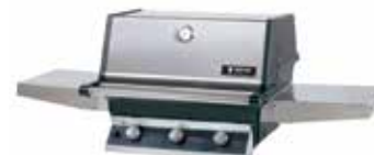
Overall Dimensions (without shelves) 26-3/4" W x 19" H x 25" D