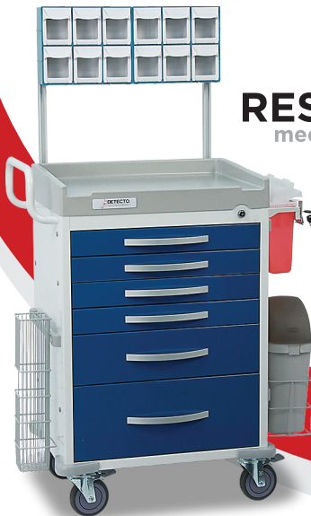
RESCUE medical carts